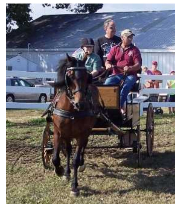
Horses for Heroes

SO, WHAT HAVE YOU BEEN UP TO? SEND YOUR NEWS & PHOTOS TO EDITOR@CVDRIVINGCLUB.COM!