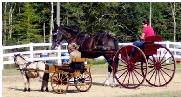
The large and small of it all!