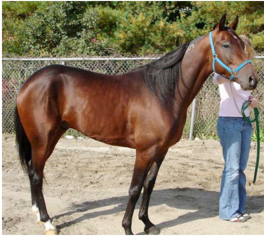
Here is an example of a STB gelding, age 4, available for adoption

Part 2 of a 3 part series on Adopted Standardbreds by member Charlotte Gelston