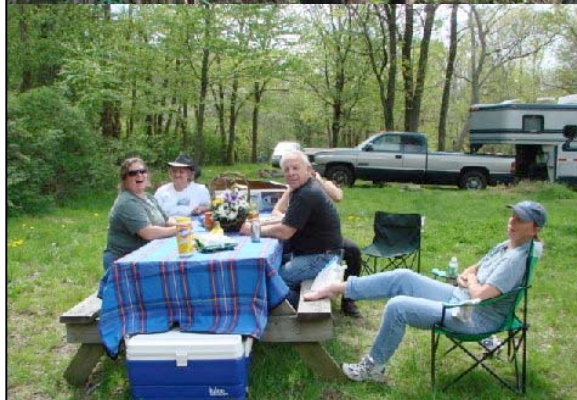
Above: Driving, camping picket line, and picnicking at Reynolds Horse Area, Escoheag