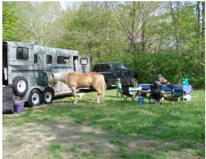
Above: A campsite at Escoheag-- Below: picket line camping

If this sounds like something that interests you, make sure you join the fun, even if it is just for the day! Help to celebrate the first National Carriage Month! All drivers are invited to come, but you must be a member of CVDC or of another regional driving club for insurance reasons. For more info on this event contact catprints2@aol.com