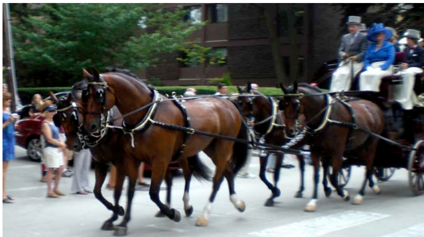
Top: View from the road as coaches roll into The Elms, Below: Once in The Elms the demonstration begins, showing off horses and coaches.

The November Issue of the Long Lines will include a recap of Newport Coaching along with more photos, in case you missed it! Stay tuned!