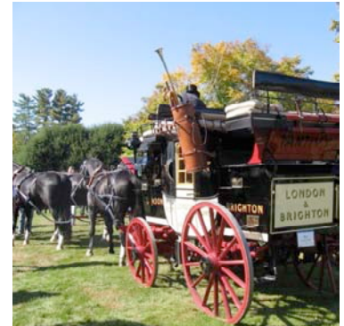
Newport Coaching. An elegant and exciting spectacle that only comes around every four years.