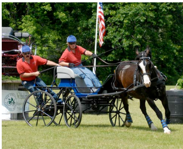
CVDC Driving Trial