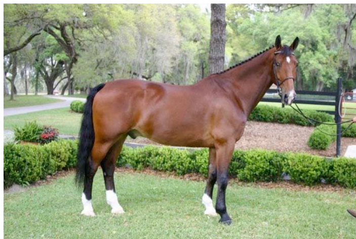
Above: Jamaica, USEF Horse of the Year!