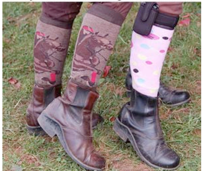
Dig those socks and matching boots We know who you belong to!