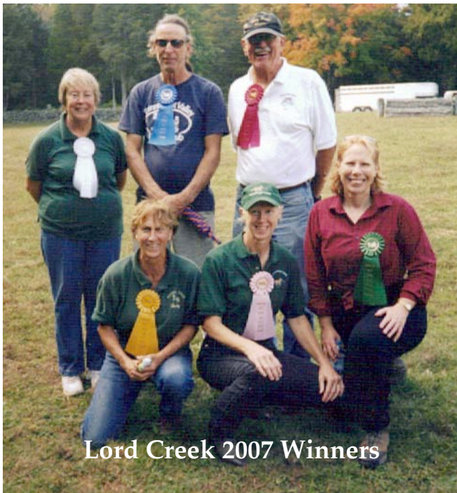
Lord Creek 2007 Winners