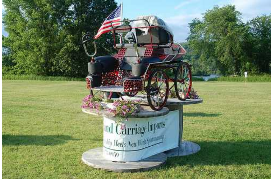
New England Carriage Imports CVDC HDT Hazard Sponsor

Come enjoy a delicious potluck and discuss final details of the CVDC Driving Trial and Fun Day. Also, our annual election will take place at this meeting, please attend to vote in person or call in your absentee ballot in advance of the meeting (see final page of newsletter).