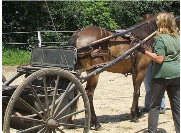
July 2009 – Pepper getting bumped with the cart.

In addition to weather issues ( ie, RAIN), there are the normal “growing baby” type of challenges. Pepper grew-stopped-grew, was uphill-downhill. She was lethargic when she came in heat. She had sore feet once after a trim. Teeth are coming in. All of these have to be taken into consideration. When some days were not conducive to one kind of work (such as long-lining), they were good for something else (going for a walk up the road). Better to be flexible than frustrated.