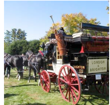
Newport Coaching. An elegant and exciting spectacle that only comes around every four years.