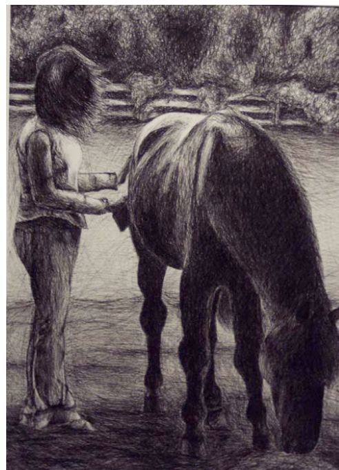
Above is a pen drawing I created in 2006 called Faithful Companion (approximately 22 x 30").