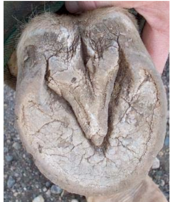
Above: Barefoot Hoof

Barefoot hoof care should not be confused with pulling shoes and doing farrier trimming. Barefoot hoof care involves subtle trims to keep the hoof at an optimum health (closest to the way nature intended), and it also involves some dietary changes for maximum hoof health. Barefoot hoof care is growing in popularity, even for the driving horse. Come and find out why!